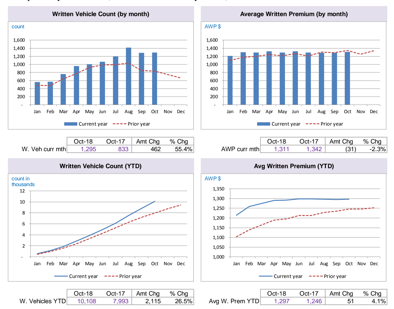
As a result of the movements in transfer vehicle counts and average written premium, the transferred premium was up 51.8% for the month compared with the 11.4% <u>increase</u> we projected last month, and was up 31.7% year-to-date (see charts at the top of the next page).

October's vehicle count transfers to the pool represent a 55.4% increase from October 2017, and counts were up 26.5% year-to-date. Average written premium was down 2.3% in October 2018, but up 4.1% year-to-date (see charts immediately below).